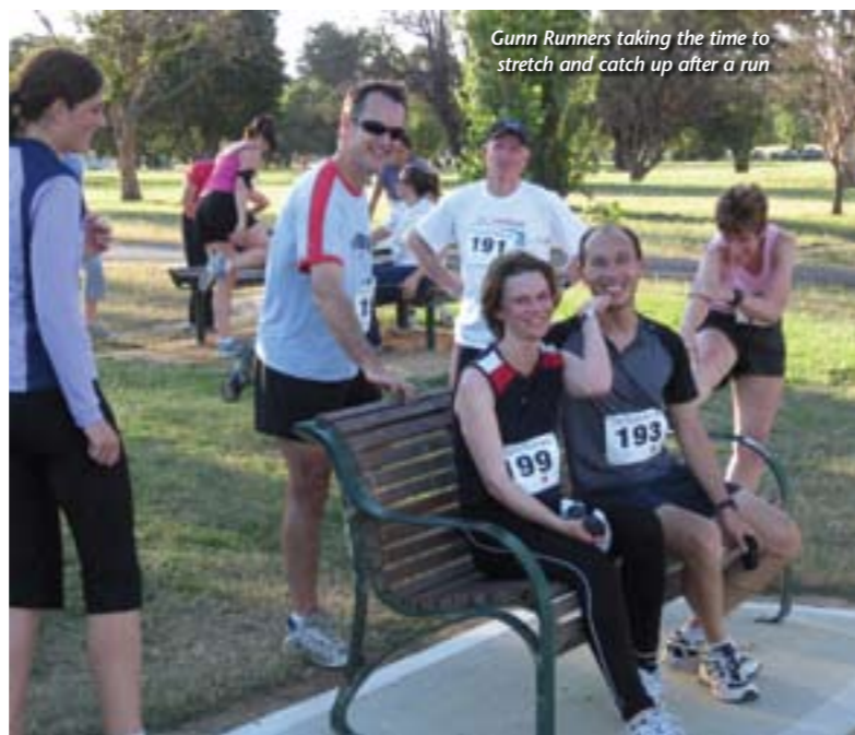
Gunn Runners taking the time to stretch and catch up after a run

"Yes, let's do it...now lift your knees!" was the