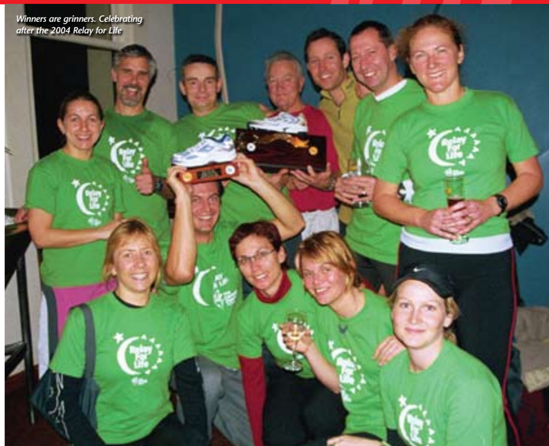
Winners are grinners. Celebrating after the 2004 Relay for Life

includes a loop of Albert Park Lake, starting on a service road to make up the distance (the lake track itself is 4.73 km). In winter, there is an 'out and back' course along lakeside drive that ensures maximum runner safety. All of the distances are measured with a calibrated Jones Oerth counter following the guidelines of the IAAF.