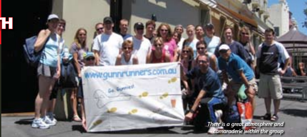
There is a great atmosphere and camaraderie within the group