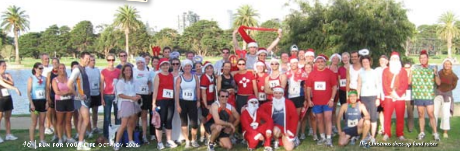
The Christmas dress-up fund raiser