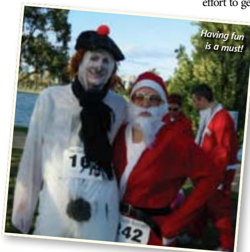
Having fun is a must!

In 2004, Parks Victoria approached The Gunn Runners to assist with planning an upgrade to the running track surface. The group was asked to answer a simple questionnaire and many of the perceived problems areas identified were upgraded, providing a direct benefit to the entire running community of Melbourne.