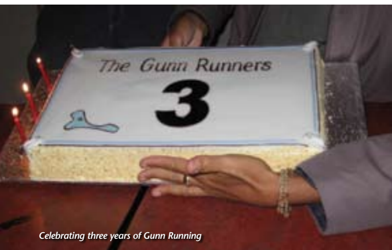
Celebrating three years of Gunn Running

In total the Gunn Runners have raised over $11,500 for these charities in the past few years.